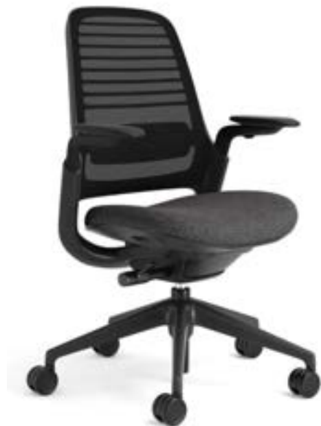
Steelcase Series 1

Steelcase is a global design and thought leader in the world of work. Along with our expansive community of brands, we design and manufacture innovative furnishings and solutions to help people do their best work in the many places where work happens.