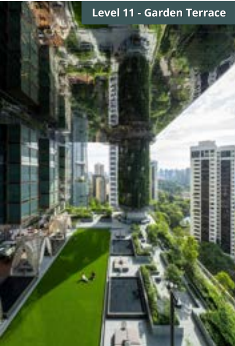
Level 11 - Garden Terrace

There are several bus pass near the hotel, including bus number 7, 36, 105, 106 and 111.