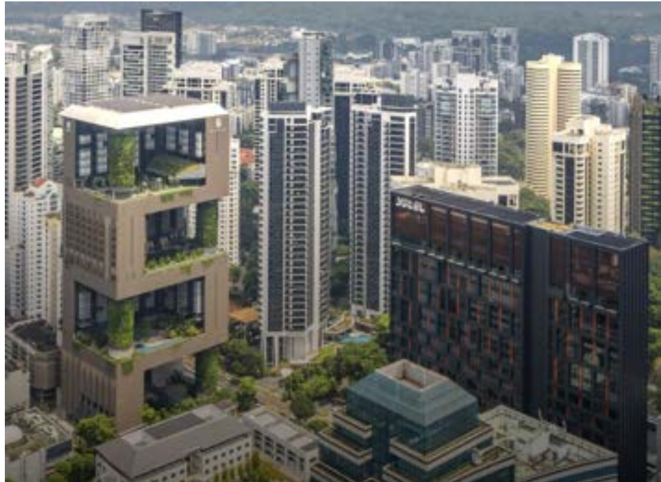
Level 18 - Cloud Terrace