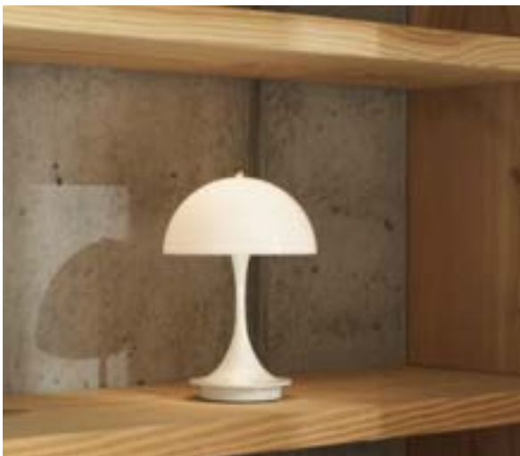
Panthella 160 Portable

The Panthella 160 Portable is a petite and portable version of the classic Verner Panton icon- the Panthella, which was designed in 1971. The recognisable, soft organic shape of the table lamp is not only beautiful but also functional, perfect for everyday use around the home against many different settings.